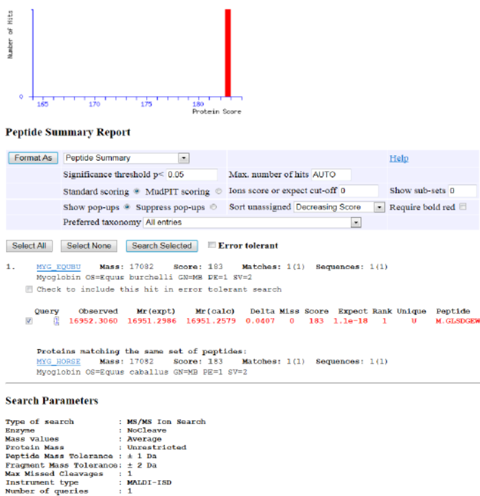
Fig.3 Mascot search result for the myoglobin sample.

A Mascot MS/MS Database Search using the LinearTOF data identified each sample as myoglobin and BSA, respectively. As an example, Figure 3 shows the Mascot database search result for the myoglobin sample. These results showed that, despite the fact that the ISD Linear data does not contain exact masses and does not provide isotopic separation of the ions, the data can still be used with a database search function like Mascot to identify proteins.