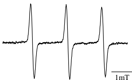
Figure 1. ESR spectrum of TEMPOL solution